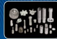
PARTS & SERVICE

COMBUSTION AND ENVIRONMENTAL SOLUTIONS. PURE AND SIMPLE.®