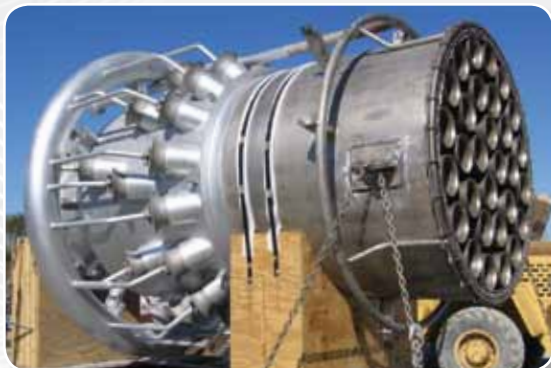
HCL Flare Tip on Truck for Delivery