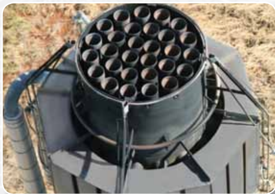
HCL Steam Assisted Flare