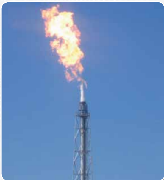
HCL Low Noise / High Efficiency Steam Assisted Flare